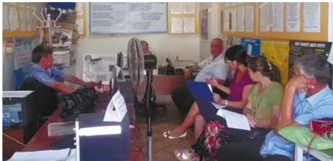
Focus group with LCPC members, Osh city

In Jalal-Abad and Issyk-Kul regions, activists complained about the unfair and closed process of selection of LCPC members.