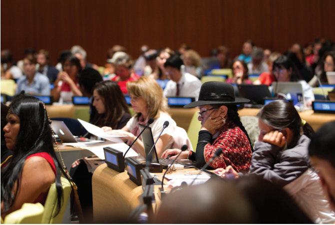
A view of indigenous delegates attending the twelfth session of the UN Permanent Forum on Indigenous Issues.