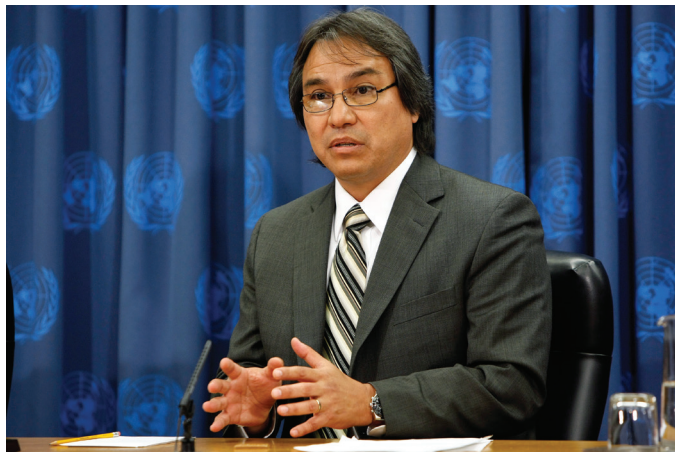
UNSRIP Anaya speaks to journalists.

The declaration now exists as an important benchmark for decision making by international and national governing bodies. The UNDRIP is an international instrument used by indigenous peoples to advance their rights. It establishes an international standard that states can use to actively promote and protect the cultural, political, territorial and economic security of indigenous peoples. It is a standard by which rights violations can be assessed and compared across nations and an important tool of reconciliation. In Anaya's words (2009), "the Declaration affirms that indigenous peoples in particular have the right of self-determination, recognizes that they have been denied enjoyment of that right, and marks the parameters for processes that will remedy that denial."