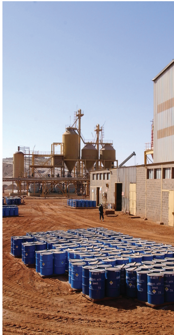
Part of the uranium mine at Arlit, in northern Niger.

As for the Central African Republic, Areva stopped conducting exploration activities there in 2012.