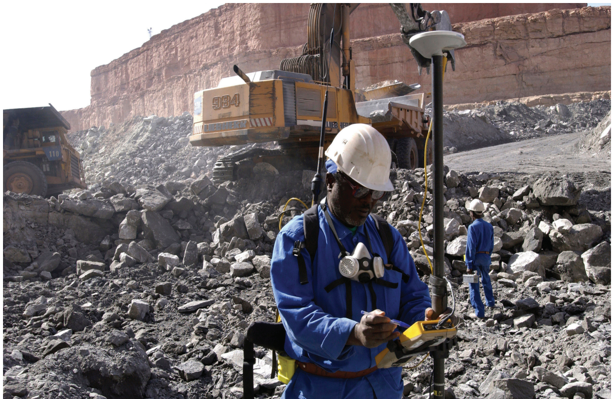
Workers at the uranium mine at Arlit, northern Niger.

Two ad hoc Franco-Nigerien companies were created: the SOMAÏR (Société des Mines de l’Aïr, 1968) for the Arlit mine, and the COMINAK (Compagnie Minière d’Akouta, 1974) for the Akokan mine. Today SOMAÏR is owned by Areva (63.6%) and the Nigerien state company SOPAMIN (36.4%); and COMINAK is owned by Areva (34%), SOPAMIN (31%), the Japanese company OURD (25%), and the Spanish company ENUSA (10%). Production began in 1971.