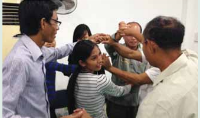
Cambodian civil society groups participate in AIJI's capacity-building session on mediation and dialogue facilitation in January 2014.