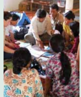
The Voices of Reconciliation project involves over 90 community dialogues a year between village residents and legal experts. This meeting (left), held in Banteay Meanchey in March 2014, brought together 54 community participants. Project participants in Phnom Srok (right) fill out a survey after a successful community dialogue meeting. Over 2,300 rural Cambodians attended meetings in March and April 2014.