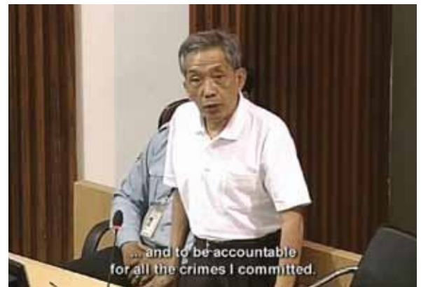
Kaing Guek Eav, alias "Duch," faces the court on the popular television series Duch on Trial, a weekly program in Cambodia broadcasting trial summaries and commentary.

Producers used a talk show format, showing highlights from the proceedings and commentary by legal experts