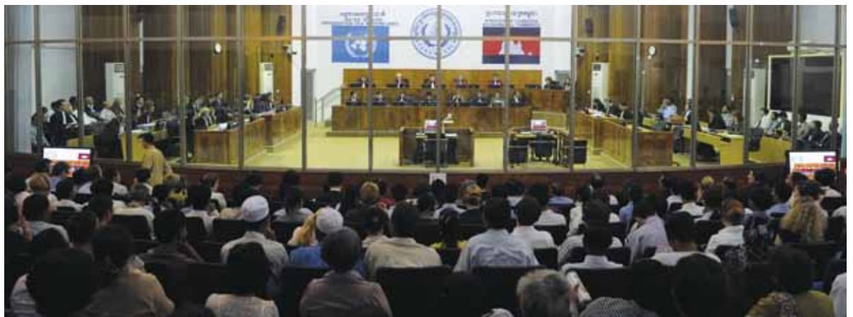
The public gallery view of main ECCC courtroom.

The ECCC is a mixed hybrid court of national and international composition, applying both international and Cambodian national law. Following the commencement of operations in 2006, five individuals were charged to be subsequently tried in two cases before the ECCC, Case 001 and Case 002. Additional prosecutions are considered but remain stagnant. One distinct feature of the ECCC is its extensive victim participation scheme. The ECCC Internal Rules allow survivors to either file a complaint with the Co-Prosecutors or to apply to the Co-Investigating Judges to become a civil party and to claim collective and moral reparations. Accordingly, victims are permitted to play an active role in proceedings with extensive procedural rights, providing them direct access to