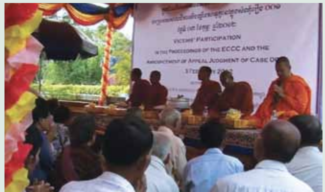
Community members, civil parties, and victims gather in February 2012 to discuss the Case 001 Appeal Judgment.