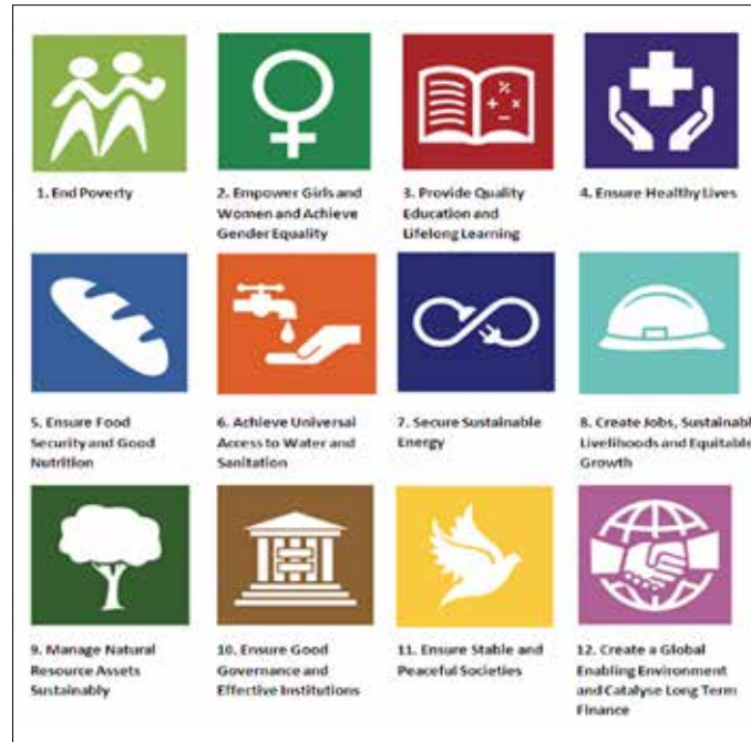
FIGURE 3: THE UN HIGH-LEVEL PANEL POST-2015 ILLUSTRATIVE UNIVERSAL GOALS