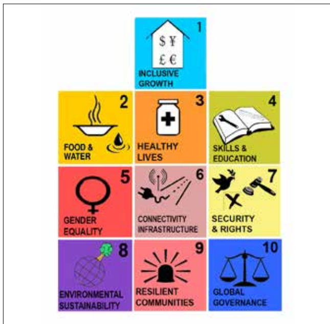
FIGURE 2: THE CIGI-KDI POST-2015 ILLUSTRATIVE GOALS