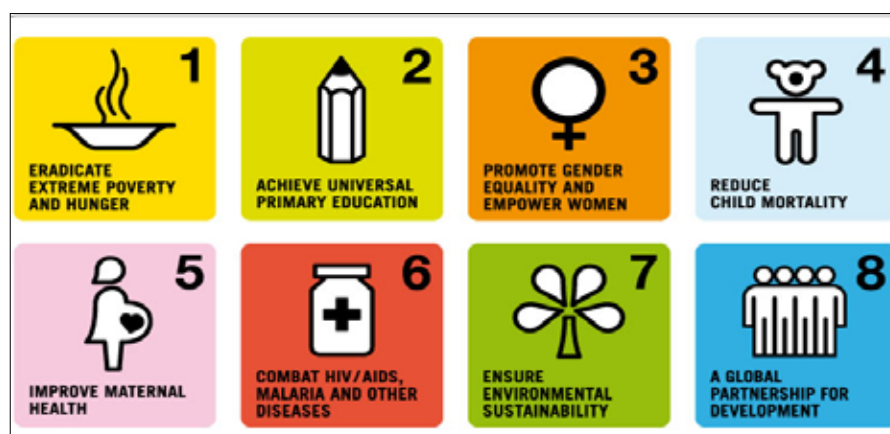
FIGURE 1: THE EIGHT MDGs