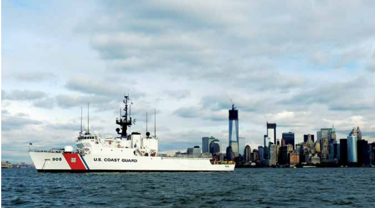
With many cell phone and radio towers damaged by Hurricane Sandy, Coast Guard Cutter Spencer provided command, control and communications platform for underway port recovery vessels.