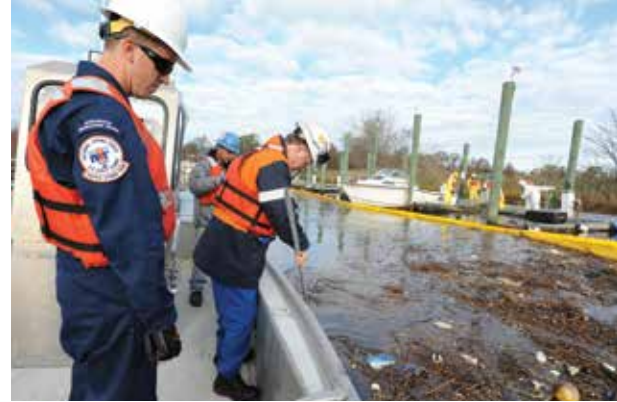
A large portion of the port recovery effort was coordinated with the oil spill response and clean up of 500,000 gallons of heavy fuel oil discharged into the waterway.