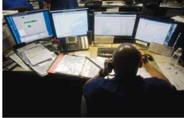
Coast Guard conducting mid-storm search and rescue coordination with New York Police Department and Fire Department, City of New York.

As the MTS-RU came together, the U.S. Coast Guard Captain of the Port notified Port leaders that the Port would be closed to marine traffic 24 hours before Hurricane Sandy's landfall. 12 This enabled Port