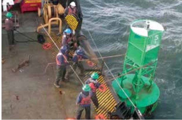
Coast Guard Cutter Willow placing aids to navigation back on station to mark shipping channels for the resumption of fuel and supplies in the region.