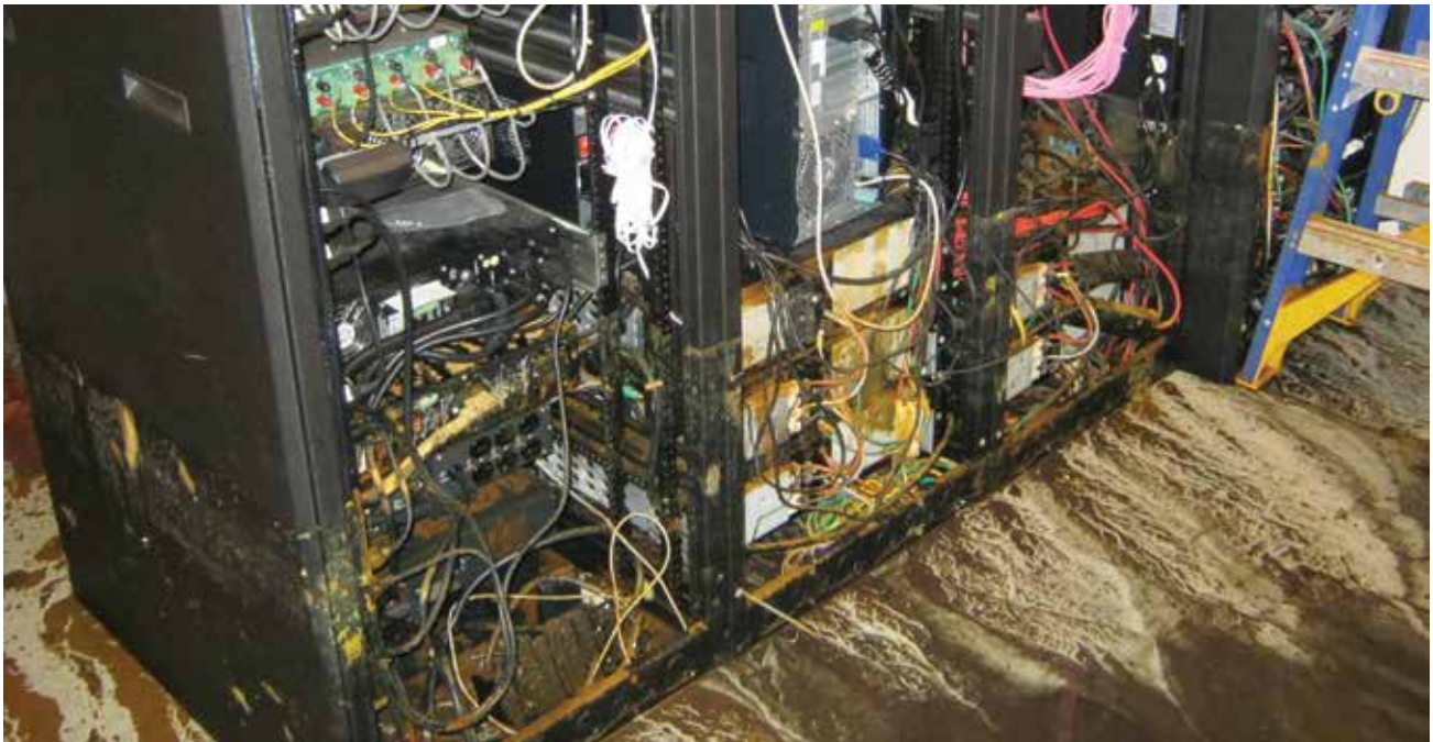
TOP: Pier damage.