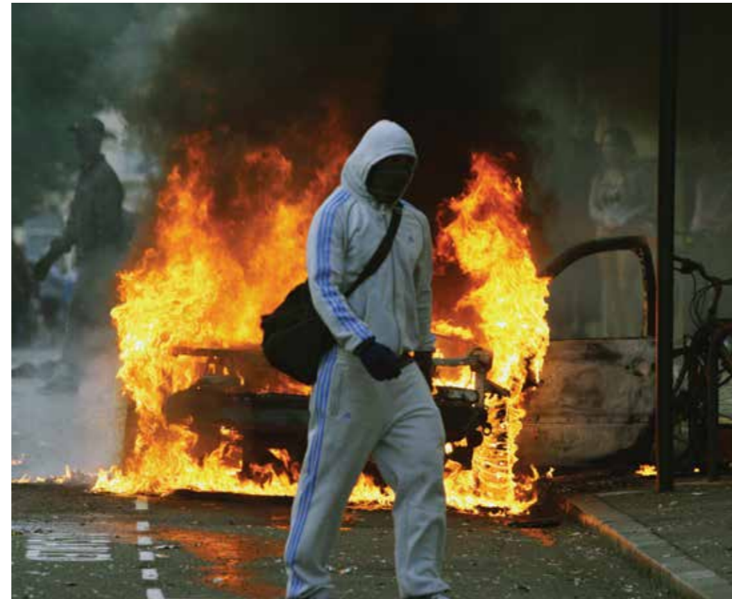
Vulnerability to violence is a universal issue: London suffers rioting and looting in August 2011.

While some countries have been seriously affected by armed conflict, people everywhere face insecurity in their lives. Any goal on peace, justice and governance should look beyond what some Member States refer to as “special situations” and ensure that freedom from fear is promoted in all countries.