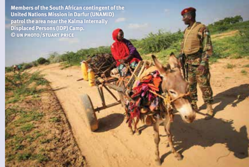
Members of the South African contingent of the United Nations Mission in Darfur (UNAMID) patrol the area near the Kalma Internally Displaced Persons (IDP) Camp.

EC Communique: A Decent Life for All, February 2014 EU common position on the post-2015 development agenda proposed 17 priority areas, emphasising that the new framework should promote good governance, democracy and the rule of law and address peaceful societies and freedom from violence.