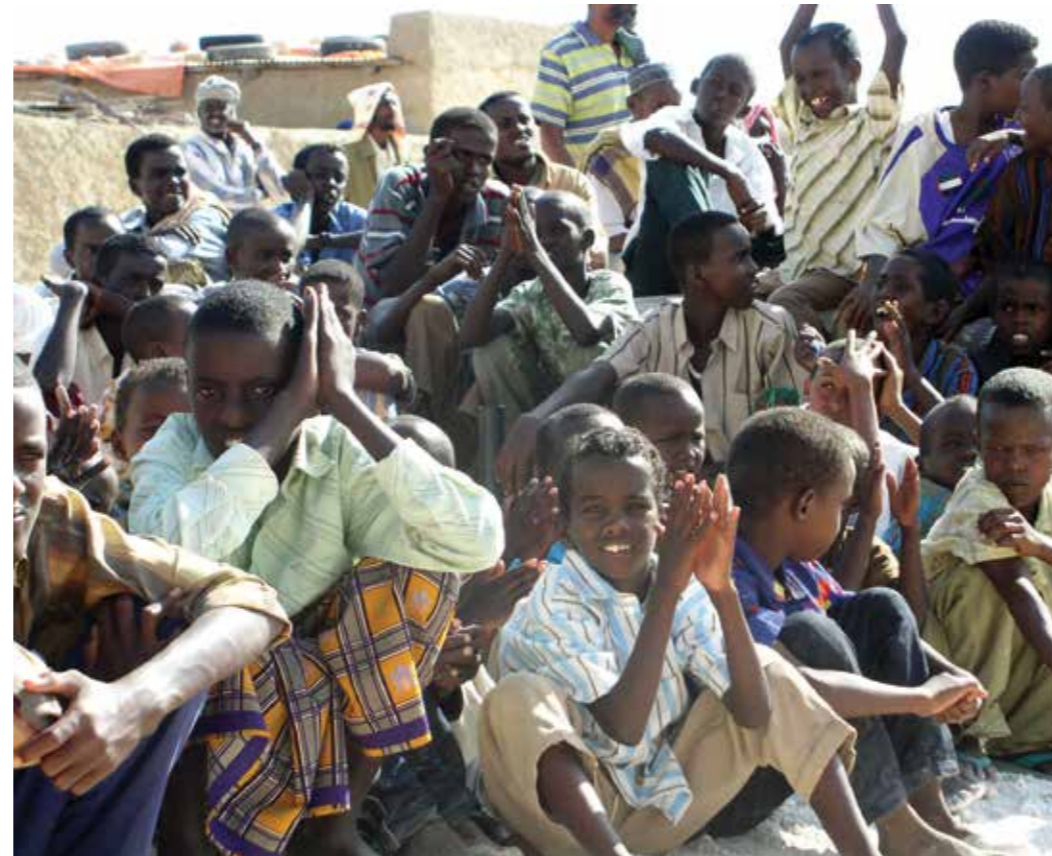
People all around the world see peace as essential to their well being. Young boys in Mogadishu, Somalia.