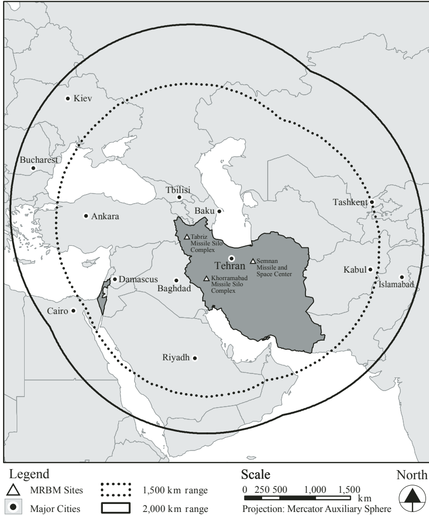
Figure 2: MRBM Sites and Ranges

has been forced to adopt a bilateral approach on BMD with the Gulf States, rather than the multilateral approach that it favors. 143