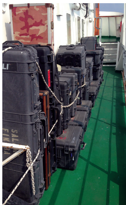
Photo 1 Storage of weapons on board a floating armoury off Fujairah, United Arab Emirates, 2014

The UK expressed confidence that arms delivered to maritime PSCs had not been diverted, observing that no evidence of diversion had been presented to the government (UKHC, 2015, para. 333). Without post-licensing checks, however, the government is not likely to find out about such incidents. The conditions of the Open General Trade Control Licence (Maritime Anti-piracy)—which authorizes vetted maritime PSCs to supply, deliver, and transfer particular types of small arms and ammunition for use onto commercial vessels in the HRA—include a commitment not to transfer the materiel to any other entity (UK, 2014). Yet anecdotal evidence indicates that maritime PSCs increasingly share arms and