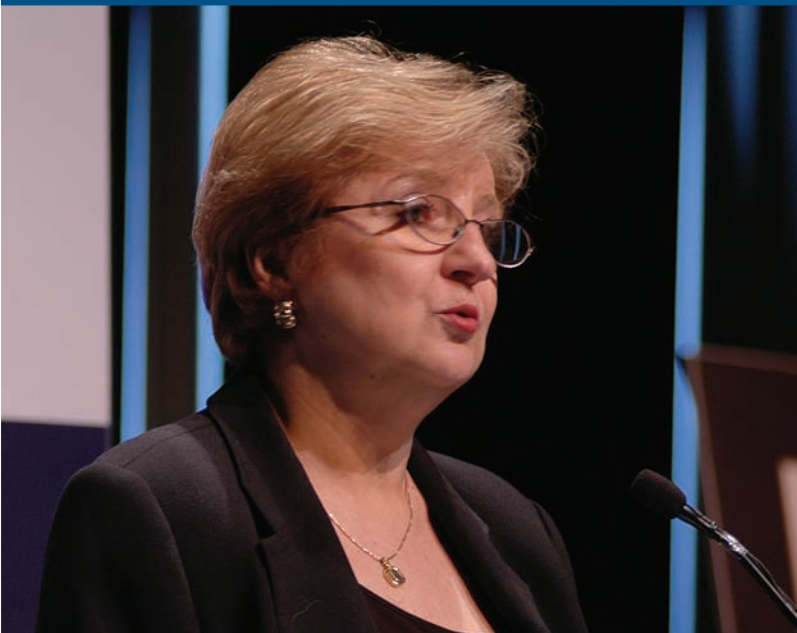
UN Deputy Secretary General Louise Fréchette opened the conference with a public keynote address on adapting the UN to the twenty-first-century.

grievous setback. Further, outcomes that produced winners and losers could be destructive of the very consensus that reform was intended to generate. Nor was it helpful to think in terms of a “grand bargain” in which the “North” got security in return for the “South” getting development. These issues were thoroughly reciprocal and member states were interdependent. Indeed, bargaining was going to be necessary within themes and within groups.