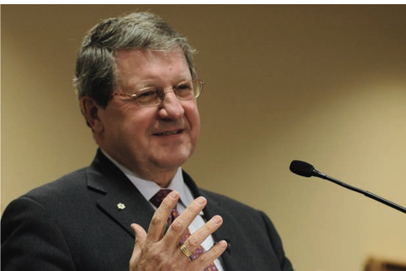
Former Canadian Minister of Foreign Affairs, Mr. Lloyd Axworthy's keynote speech addressed the issues of human security and the "Responsibility to Protect".

In the Third World, the U.S. invasion of Iraq and its ex post facto rationalization on human security grounds had created an atmosphere of distrust that was affecting attitudes towards reform generally and undermining the emerging norm of the Responsibility to Protect, in particular. Politically motivated attacks in Congress on the UN and on the Secretary General affected the atmosphere in New York and in capitals around the world. Some observed that the Congress held the secretariat to higher standards of probity and effectiveness on the Oil for Food program than they