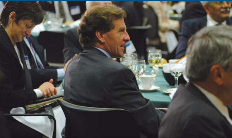
His Excellency Allan Rock, Canada's Ambassador and permanent representative to the United Nations.

inevitably entails give-and-take. Pursuant to the discussions in Waterloo and elsewhere, there appeared to be a handful of truly transformative innovations that, with the requisite statesmanship, should be collectively within reach: