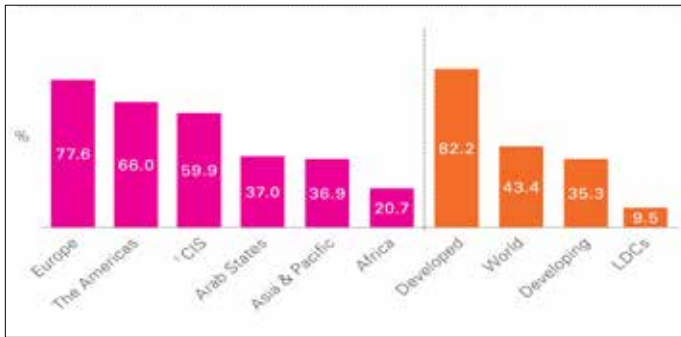
Figure 2: Percentage of Individuals Using the Internet

Source: ITU World Telecommunication/ICT Indicators database, reproduced with permission.