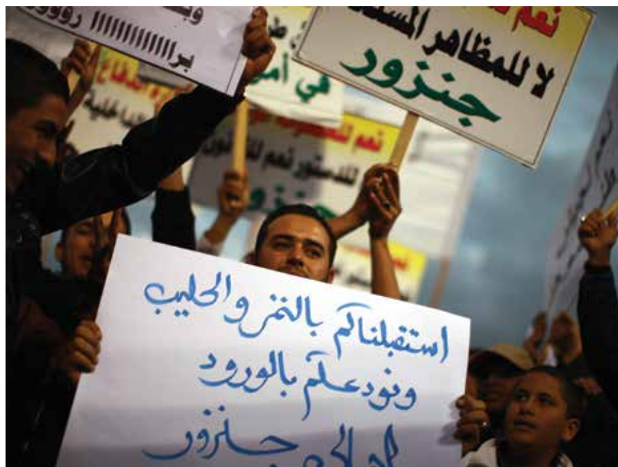
Crowds in Tripoli protest against insecurity. Since the adoption of the 2030 Agenda, there is now consensus around the need to promote peaceful societies in the new development framework.

With an agreement on the 2030 Agenda – which includes a strong focus on peace in Goal 16 and across other elements of the framework – discussions are now