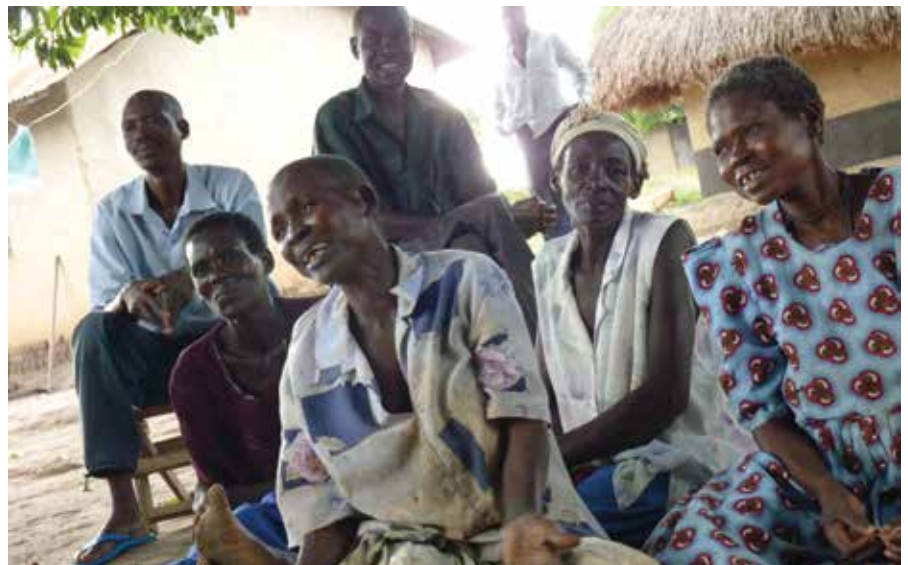
Women take part in a focus group discussion conducted as part of a study on resource and land conflict in northern Uganda. An SDG target on fair access to resources and control over land is included in the 2030 Agenda.

Peace is also about much more than just the absence of physical violence. While often the search for peace is seen as an end to armed conflict or the enforcement of stability, for many peacebuilders the absence of physical violence is only the shallow beginning of a much longer-term peacebuilding process. A deep or ‘positive’ peace includes changes in the attitudes of conflicting parties and the transformation of the systemic and structural elements that form part of the reasons for why the tensions that are present in every society spill over and become violent. Acknowledging and transforming structural violence, including the systems responsible for marginalising and exclud-