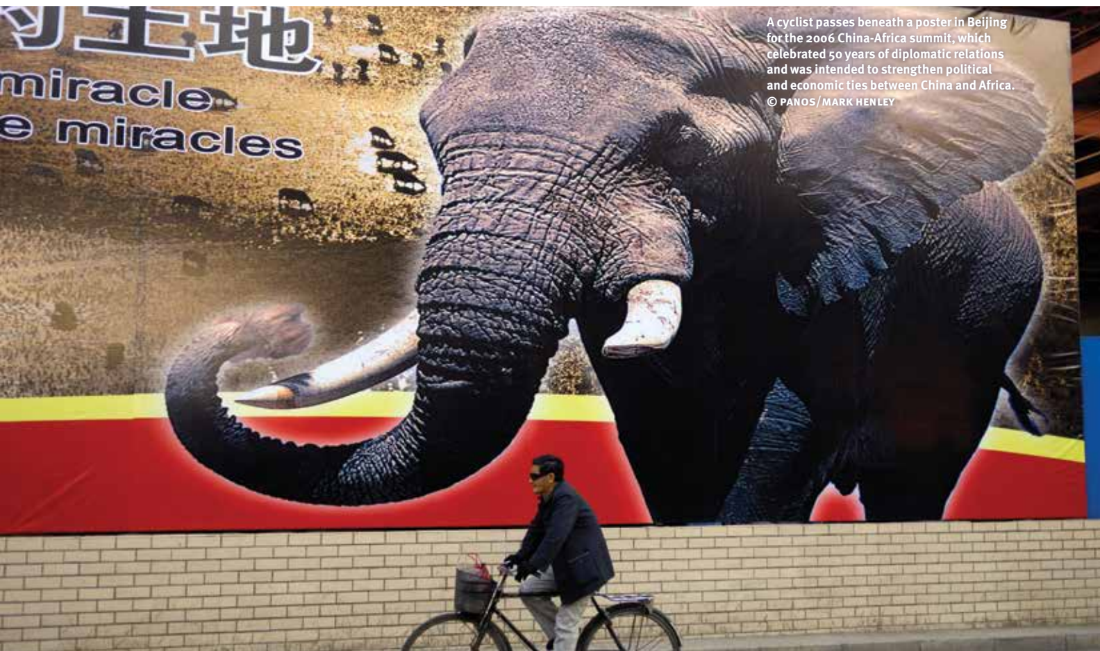
A cyclist passes beneath a poster in Beijing for the 2006 China-Africa summit, which celebrated 50 years of diplomatic relations and was intended to strengthen political and economic ties between China and Africa.