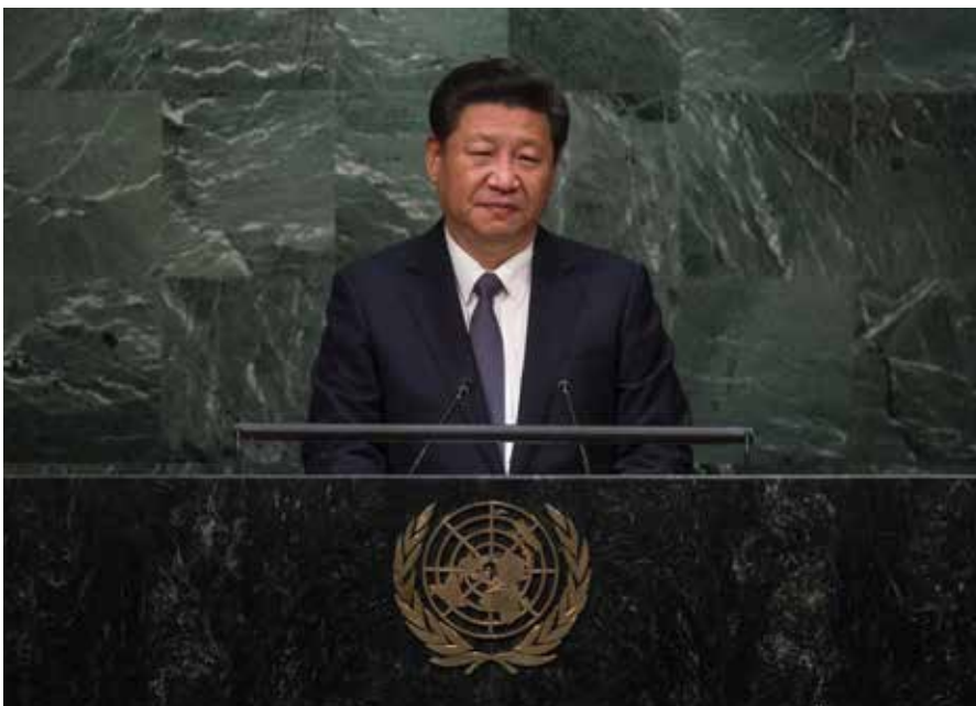
Xi Jinping, President of the People's Republic of China, addresses the United Nations summit for the adoption of the 2030 Agenda.

However, China and Africa's positions also differed slightly. Although both sides uphold the principle of Common but Differentiated Responsibilities (CBDR), Africa put more emphasis on the growing importance of South-South cooperation and would like to explore this area of cooperation further, working with a range of different development partners. 30 China, however, has argued that “North-South cooperation should continue to serve as the main channel of development financing” and that “South-South cooperation is a supplement to North-South cooperation”. 31