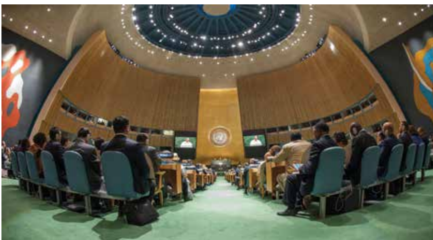
Pope Francis addresses the UN General Assembly at the UN Sustainable Development Summit in September 2015, during which the SDGs were adopted.

It needs to be remembered that violence and insecurity are universal issues with a negative impact on people's lives worldwide, not solely in states currently affected by armed conflict. 9 For instance,