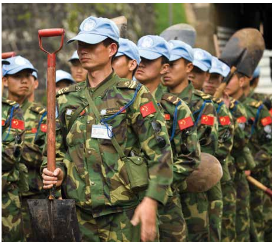
Chinese peacekeepers in the Democratic Republic of the Congo march to a road rehabilitation project, which was undertaken to enable greater access to the Ruzizi One Dam Power Plant – the only source of electricity for the east of the country.

The FOCAC process has been a key forum for specific agreements on African peace and security. Peace was identified as one of five key areas for deepened cooperation in former President Hu Jintao's speech at the opening ceremony of the Fifth FOCAC meeting in July 2012. He stated that the Chinese and African people shared a desire to seek peace and development and recognised the need to "promote peace and stability in Africa and create a secure environment for Africa's development", which China would contribute to. 45 In the current FOCAC Action Plan (2013–2015) which emanated from this meeting, China and Africa stated that they "shared the view that the challenges confronting