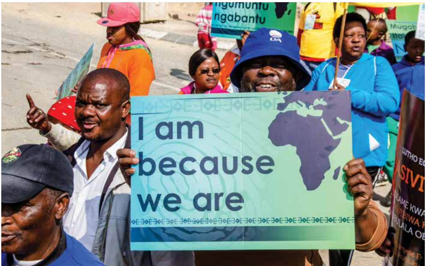
People take part in a march to promote African solidarity in an area of Alexandra, South Africa that is affected by xenophobic violence.

China still views itself as a developing country with its own domestic challenges and is reluctant to be seen as a donor. As such, China does not believe it should make concrete commitments on aid to the same degree as developed countries. In addition, China has tended to envision a narrower development framework, which focuses on the three core pillars of development – the economic, social and environmental pillars 32 – while Africa has committed itself to a more ambitious agenda, which includes issues of human rights, good governance, rule of law and peace and security. 33