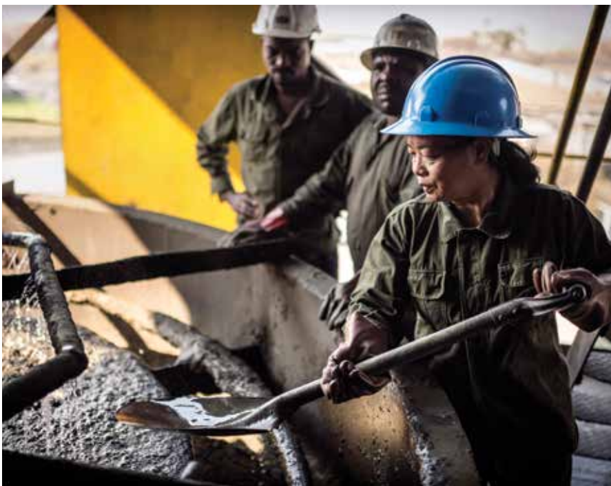
A Chinese operations manager works at a copper mine in Zambia. The mine is owned by the Non-Ferrous Company Africa, a Chinese company that owns and operates several mines in Zambia's Copperbelt Province.

It is argued by Chinese officials and scholars that China's engagement on African peace and security issues extends beyond reactive and hard security approaches – such as the deployment of peacekeepers – to actions that will help address the root causes of conflict. Promoting economic growth has been seen as one such contribution. During a UNSC meeting on post-conflict peacebuilding in March 2014, Chinese Ambassador Liu Jieyi stated that "...post-conflict peacebuilding efforts should focus on removing the deep-rooted causes of conflict, with a particular