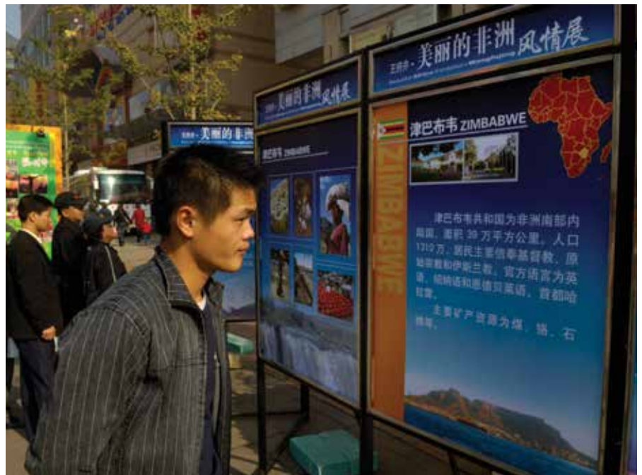
A young man in Beijing reads about Zimbabwe on a display for the 2006 China-Africa Summit.

Nonetheless, as dialogue increased on this issue and concerns and misconceptions were addressed, China showed greater flexibility. At the Tenth Session of the OWG, China stated that “we acknowledge the importance of peaceful and non-violent societies, rule of law and capable institutions and their linkage with development, which create an enabling environment for sustainable development.” 38 In addition, at the 12th and 13th Sessions of the OWG, China was open to putting a number of peace-related targets into a merged Goal called “Means of implementation, enabling environment for sustainable development and strengthening institutions”, combining Goal 16 and Goal 17. This included targets on violence reduction, corruption, organised crime, illicit flows of arms, finance, drugs and wildlife as well as