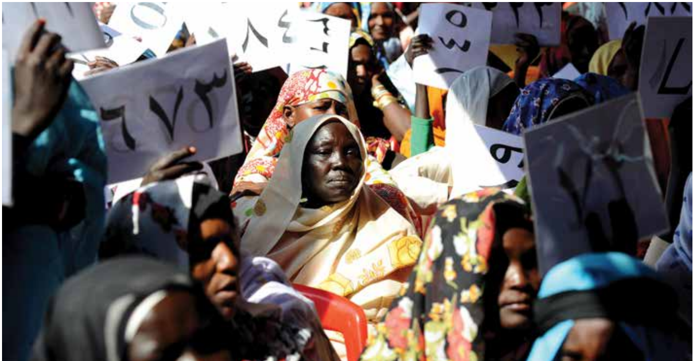
Sudanese people take part in ‘Citizen Hearings’ in Blue Nile State, part of a process of popular consultations where residents can express whether the 2005 Comprehensive Peace Agreement (CPA) has met their expectations.