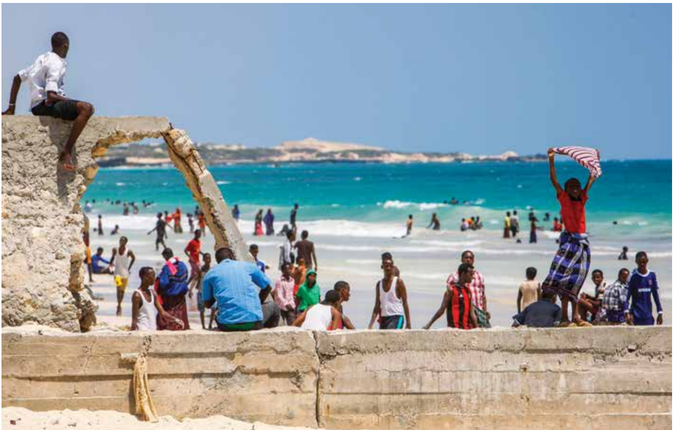
People visit Lido Beach in the Somali capital Mogadishu. The African Union Mission in Somalia (AMISOM), a peace enforcement mission, has been deployed in southern and central areas of the country since 2007. AMISOM has received significant financial and logistical support from China.

“The support for the promotion of peace and stability in Africa has been voiced at the highest political level in China.”