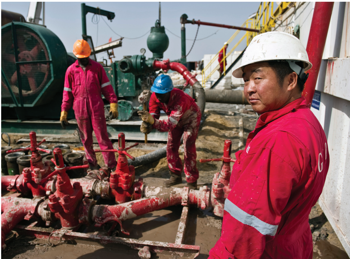
Chinese employee working on an oil rig in South Sudan. China has invested heavily in the country's oil industry

More often than not, the interests of Chinese actors in Africa and the Middle East converge around common objectives. Building globally competitive national