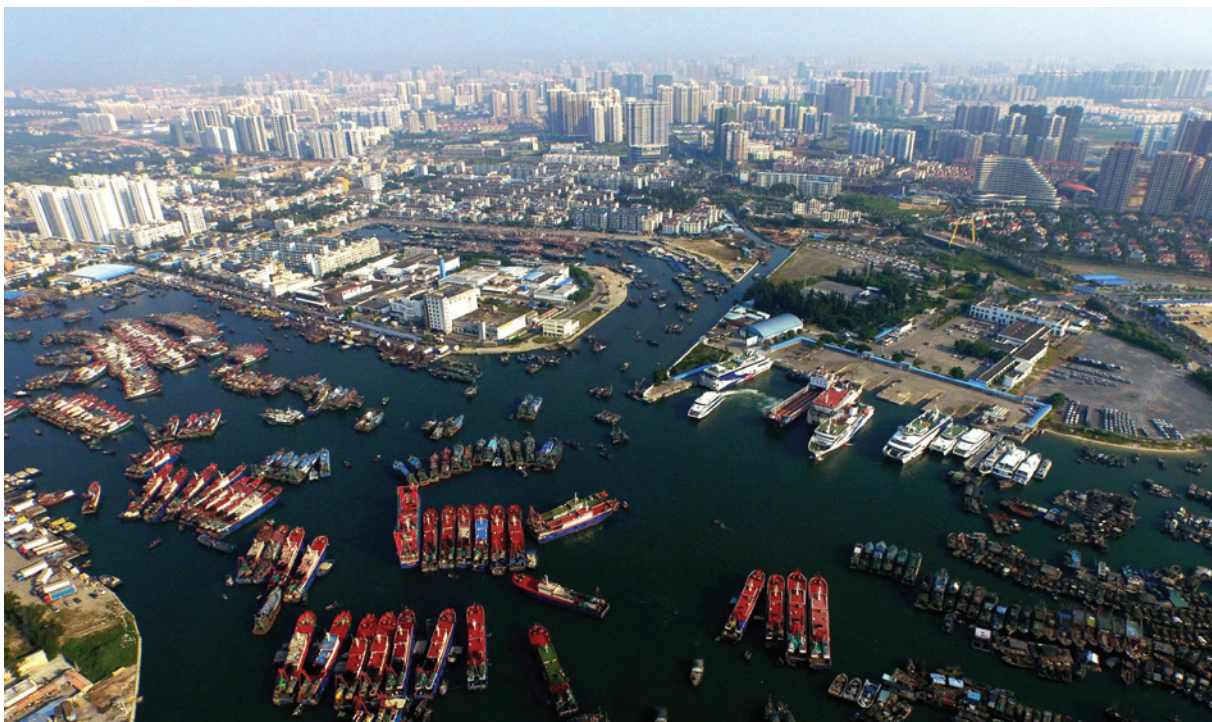
The port in Beihai in southwest China, starting point of the country's ancient marine silk road and one of the main export channels of the 21st-Century Maritime Silk Road

Second, the enthusiasm for the Belt and Road is at odds with the growing risk aversion plaguing Chinese institutions, be it for fear of corruption probes or due to the economic slowdown and greater scrutiny on expenditures. After almost two decades of overseas investments, Chinese companies and officials are facing intense pressure to show that their ventures in far flung corners of the world have reaped benefits, but many of them are finding it hard to do so: In 2013, for instance, the Vice President of China's Mining Association estimated that 80% of Chinese overseas