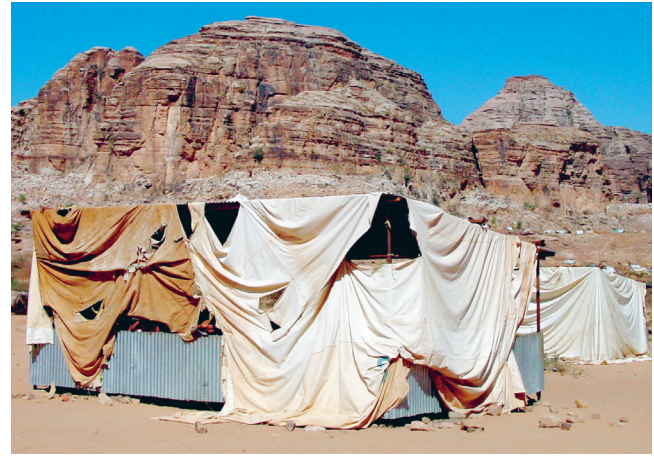
Refugee camp in Tsorona, a war-torn town on the Eritrea-Ethiopia border.

addressing the complex drivers, including the Eritrean-Ethiopian conflict.