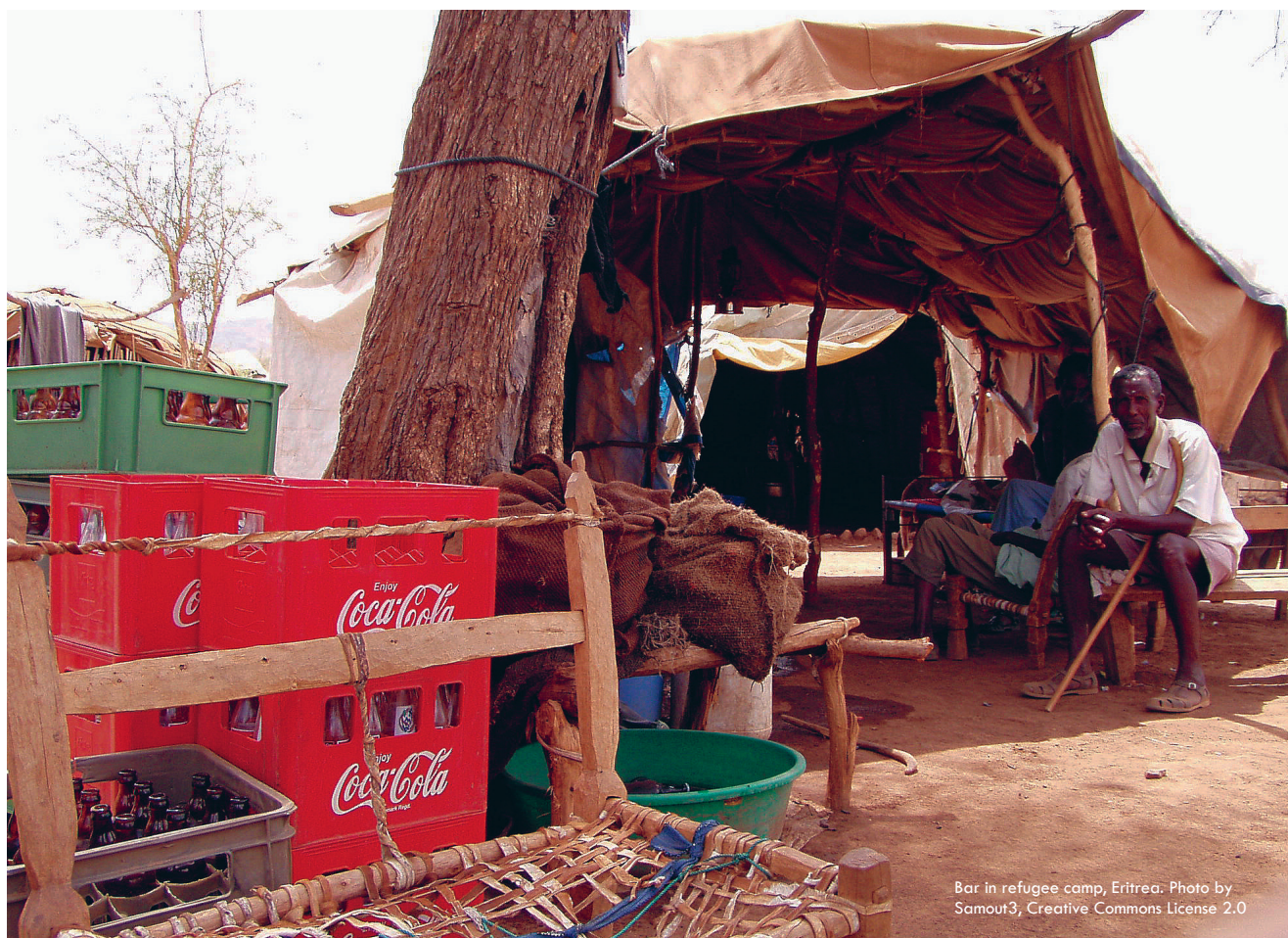
Bar in refugee camp, Eritrea.

drafted, democratisation stalled. The Eritrean People's Liberation Front (EPLF) and its successor the People's Front for Democracy and Justice (PFDJ) were the only parties legally allowed to function. The EPLF/PFDJ government subscribed to a model of guided democracy involving popular participation, rather than a liberal multiparty system. At the same time, promising pro-