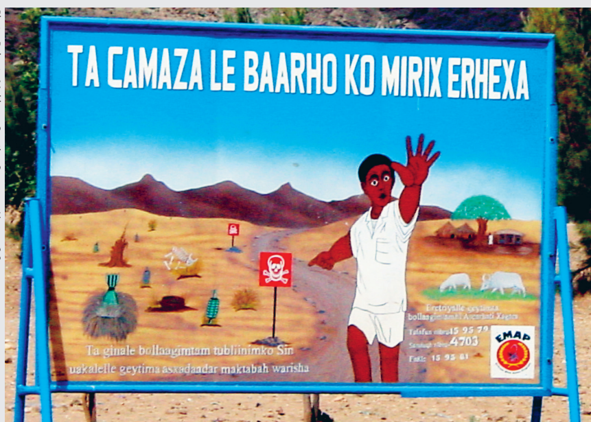
Billboard warning of mines around the Tsorona refugee camp, Eritrea.