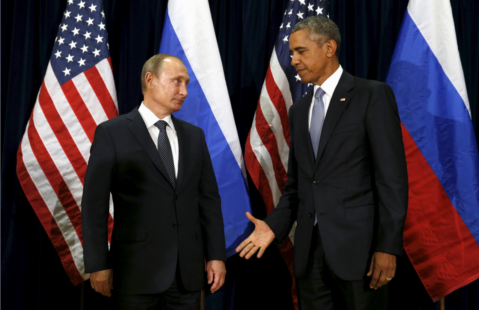
US President Barack Obama extends his hand to Russian President Vladimir Putin during their meeting at the United Nations General Assembly in New York, September 28, 2015.

the solution. Given the wealth of intelligence at Russia's disposal, both from its own sources and those of Assad, the idea that this was an innocent misunderstanding can be ruled out.