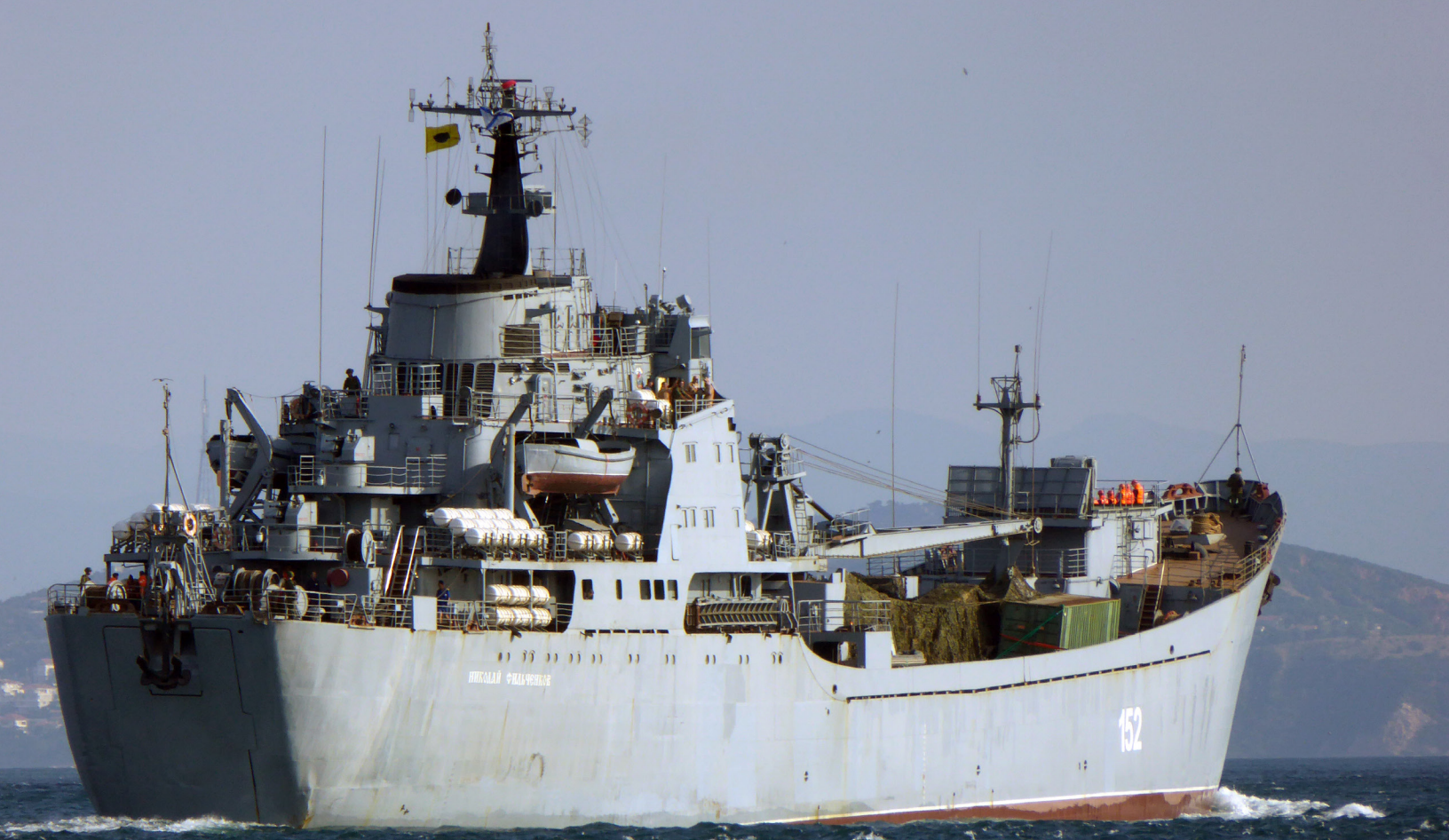
Tapir class Large Landing Craft Nikolay Filchenkov of the Russian Navy's Black Sea Fleet seen exiting the Bosphorus strait, southbound toward Syria.