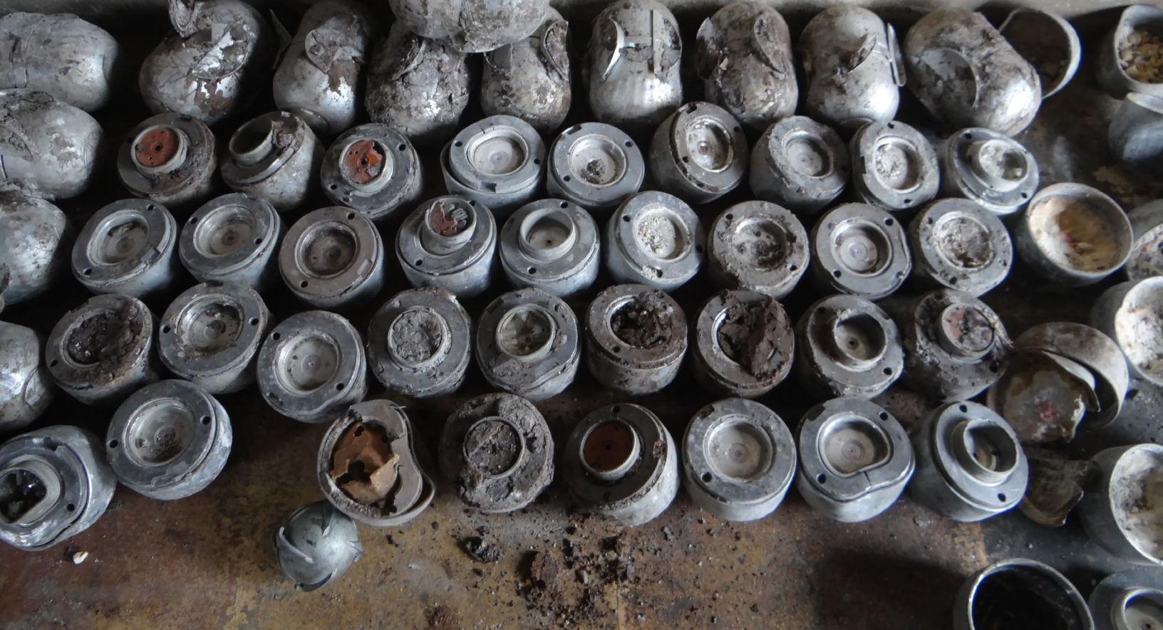
Photo of RBK-500 AO2.5RTM Cluster Bomb casings dropped on the town of Talbisah, Homs, February 2016.

“There is no confirmation of that.” 58 Lavrov also managed to insinuate that there were other possible culprits: “The region is loaded with weapons, which are being brought into Syria and other countries in huge amounts and illegally.” 59