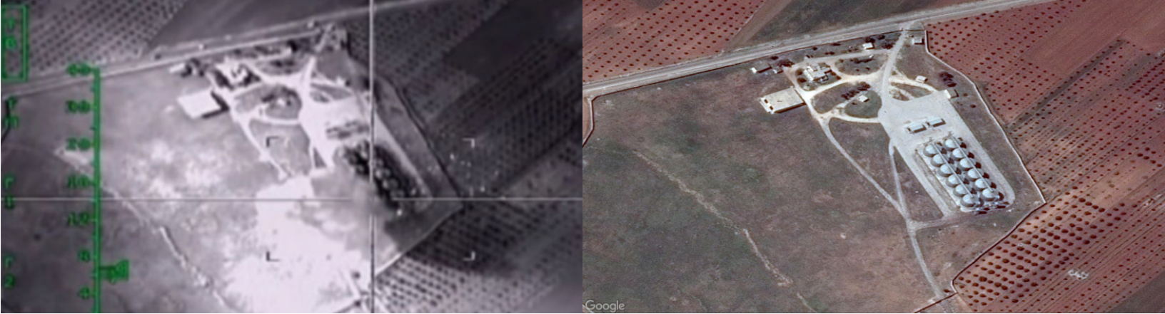
Satellite imagery from Google Earth reveals that the supposed oil storage facility in Al-Thawrah, Syria was actually a grain storage facility located 150 km from this city, at 35.597983, 36.8637443.

Hama, where there was no known ISIS presence. The Russian MoD then published a second video of the same site being bombed on October 3, 25 this time describing the location as an ISIS command post near Raqqa, which is, in fact, over 200 km away from the actual location of the air strike.