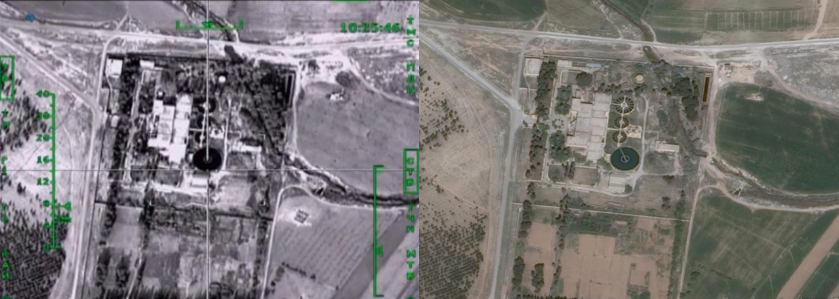
Satellite imagery from Google Earth [right] reveals that the supposed oil refinery near Khafsa Kabir, Syria [left] is actually the al-Khafsa water treatment facility, located at 36.178345, 38.041224.

days before the actual strikes, on February 10. The MoD statement further asserted: “this fabrication had been prepared but not realized the day before the meeting of the heads of foreign ministries of Russia and the USA in Munich, the results of which, as the Russian Defense Ministry assumes, are so opposed by Turkey.” 49 The MSF reports from February 10, in fact referred to other incidents, 50 and this allegation by the Russian Ministry of Defense was just one of several strange, conspiratorial claims made in their statement on the bombings. 51