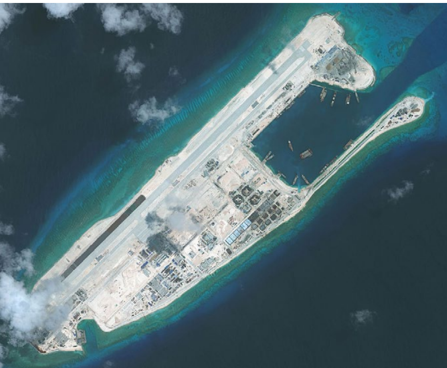
Fiery Cross Reef, following extensive land reclamation operations, is now host to what appears to be a military-grade 3,000-meter airstrip. The Philippines contends that Fiery Cross is not legally an island, but a rock, and entitled to no more than a 12 nm territorial sea, limiting the scope of the feature's otherwise de facto Chinese control.

Multiple motivations will inform the Tribunal's ruling. The five-member panel is well aware that this is the most closely watched international maritime case in UNCLOS history, and one that has substantial implications for the Law of the Sea as well as politics in the region. It will seek to be faithful to precedent, but will also be aware that it is setting a far-reaching precedent of its own. The Tribunal will seek to inject maximum legal clarity into the South China Sea disputes and to reduce their scope, while also issuing a ruling that will be viewed as legitimate. This will encourage other claimants to pursue arbitration.