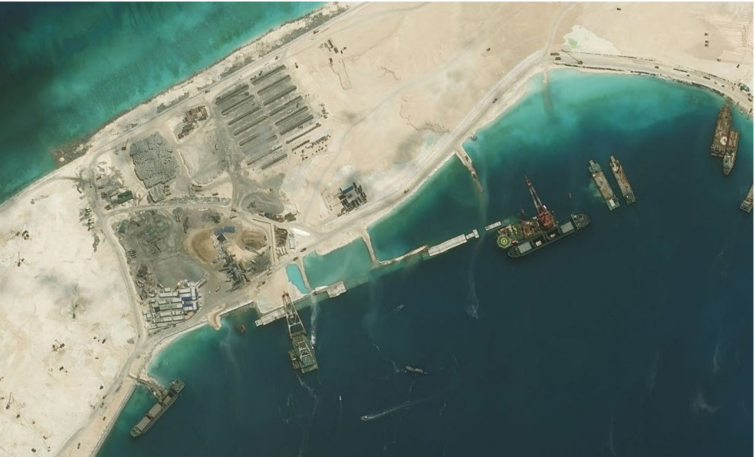
In this overhead image, Chinese artificial island construction is visible atop Subi Reef in the South China Sea's Spratly Island group. Mid-ocean features' maritime entitlements are generally derived from their natural state under UNCLOS, and artificial augmentations like these are not expected to alter the underlying feature's legal status.

If China wishes to defend the Nine-Dash Line based on historic rights, it would need to expressly argue this before the Tribunal.