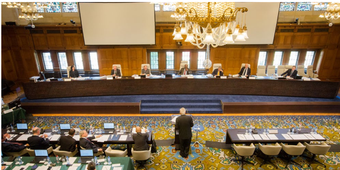
The Philippines' legal team presents its case in oral arguments at The Hague. The Chinese team's seats stand empty.

The Tribunal may be especially hesitant to rule on the rocks vs. islands question in the case of Itu Aba, which has been held by Taiwan since 1946. Itu Aba is the largest natural feature in the Spratlys, so if it does not qualify as an island, no other Spratly features should. Taiwan, however, has not had the opportunity to present information on Itu Aba's status before the Tribunal, and it could be reasonably argued that Itu Aba can support human and economic life. The Tribunal may therefore be wary of ruling Itu Aba a rock, lest this result in backlash from Taiwan and others in the region.