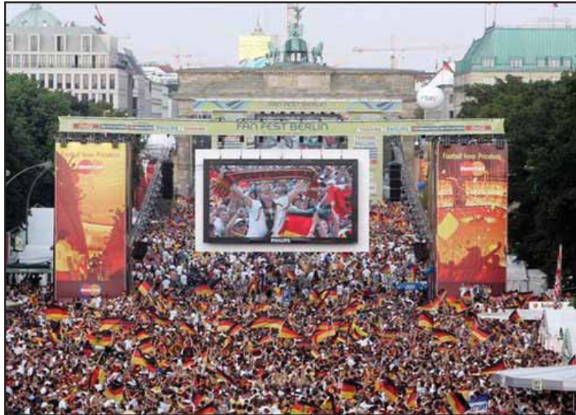
Enthusiastic German fans celebrate the Soccer World Cup 2006

During last summer’s soccer World Cup, Germans partied in the streets, waving flags and rooting for the national team, which exceeded expectations by making it to the semi-finals. This optimistic attitude seemed to spill over into the economic and political arenas. With a new chancellor, strong