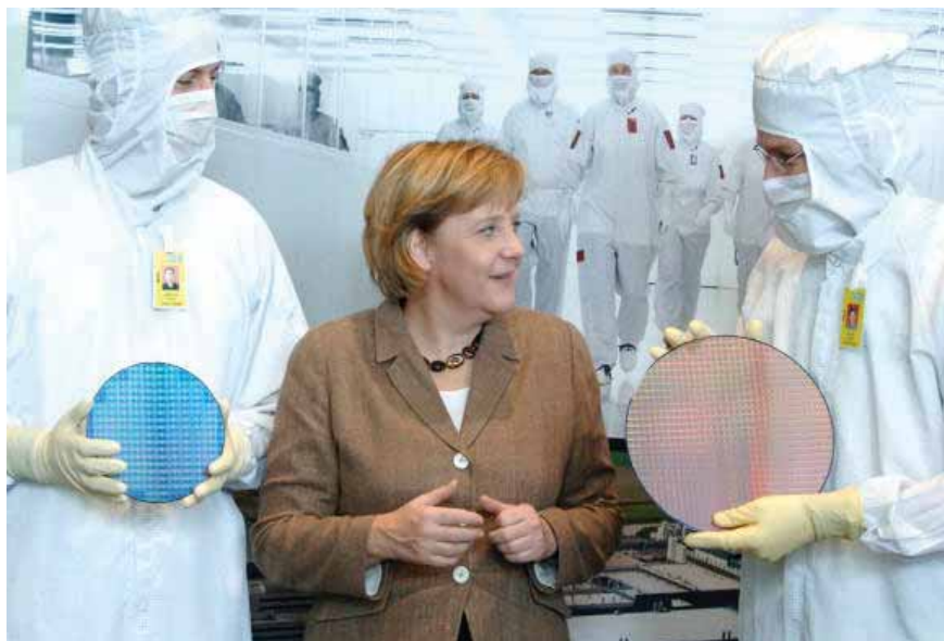
Chancellor Angela Merkel at the AMD micro-chip factory in Dresden, Germany

For more information on the project, please visit www.acus.org .