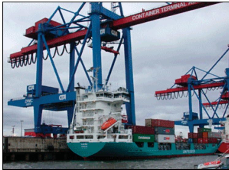
Vital to Germany's export industry: container port in Hamburg

— Position Germany as a leader in the European economy. Germany is far from the days of the 1960s and 1970s, when it was truly the economic locomotive of Western Europe. But the size of its economy — Germany alone accounts for one third of the eurozone's GDP — makes its sluggishness or growth decisive. Despite economic success in some of the smaller states, the eurozone saw only modest growth until Germany began to move forward. Now the question is whether a few others, especially France and Italy, will be encouraged enough to launch their own reform programs. Only a German chancellor with a stronger, more liberal domestic economy will have the credibility to push her colleagues to reduce the regulatory barriers to a true Single Market, as envisioned in