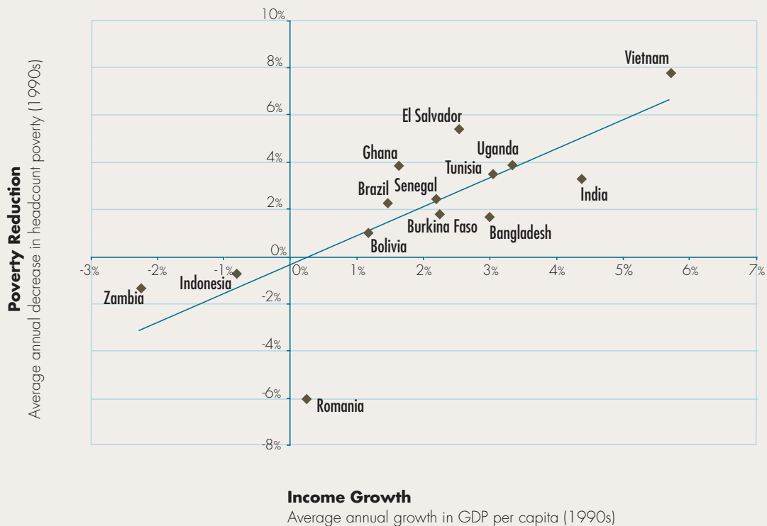
Figure 1: Growth and Poverty Reduction: Not a Simple Relationship