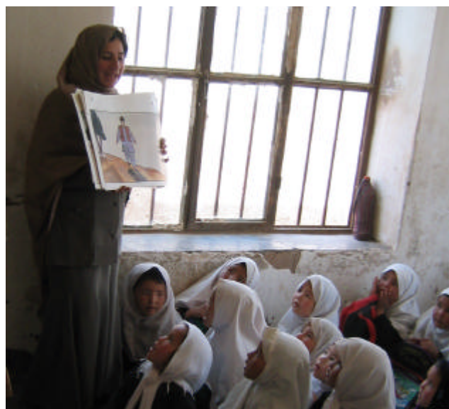
Returning refugees receiving mine awareness.

The conference, held in October 2003, surveyed the existing refugee situation – on which little information is generally available – and discussed ways of promoting solutions that reflect the interests of both the host state and the country of origin, as well as the refugees themselves. In addition, participants emphasized that the Afghan refugee situation in Iran is also affected by broader developments in the region (above all, the refugee policy of Pakistan, traditionally the other large hosting country for Afghan refugees), and in turn affects countries that are further from the region. (In Norway, for instance, the number of Afghan asylum-seekers was three times higher in 2003 than it had been in the previous year. Most of these had previously been in Iran, Pakistan or other countries before coming to Norway.)