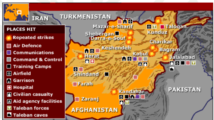
Flashpoints in the present conflict

Last year, the Taliban fought what was termed “positional warfare.” This entailed fighting for a territory and holding on to it. The districts of Uruzgan, Helmand and Qan were the strongholds last year. As efforts by the coalition forces to contain the Taliban went in vain, the Taliban gained confidence and raided numerous towns, especially in the south. Although these towns were then regained by the coalition forces, the purpose of