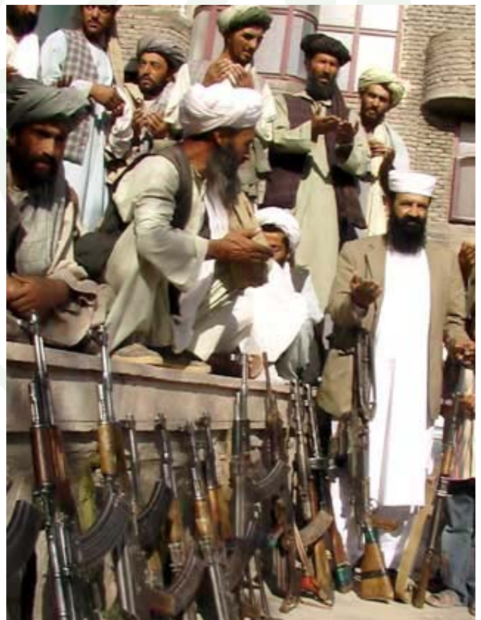
The Taliban is resurgent in southern and western parts of the country.

There are tactical issues and there are problems with the overall strategy. The Taliban have numerous advantages over the coalition forces. They have a wide recruiting base and therefore greater staying power. The number of volunteers seems to be increasing on a daily basis. What were dismissed as boastful claims of Taliban commanders are now turning into realities. It does not help that the Pakistani border is porous and provides shelter to these militant camps. Hamid Karzai and Gen. Musharraf have had constant verbal spats on this issue but no plausible solution seems imminent.