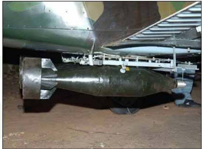
LTTE Aircraft with Bombs at their Base

situated the air attack within the context of the general escalation of violence in Sri Lanka. New Delhi did not officially condemn the attack, but called for a solution to the ethnic issue. 6 On its part the United States, while expressing its concern regarding the air capability of the LTTE, observed that Sri Lanka now has an important opportunity to achieve peace." 7 The first attack on the same airport in 2001 and its wide-ranging implications