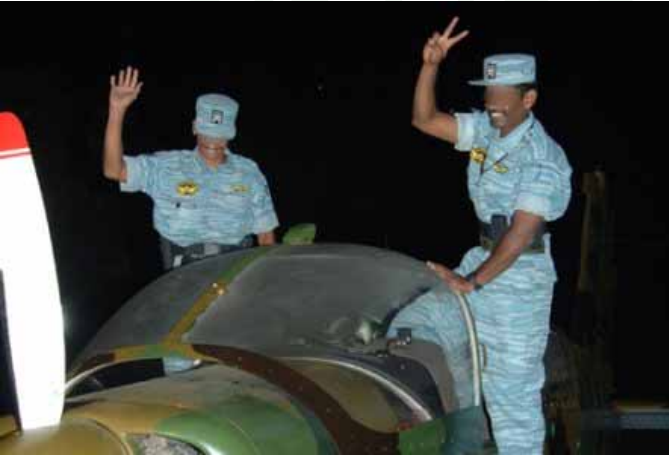
Air Tigers with their light aircraft

Second, the SLAF was instrumental in inflicting