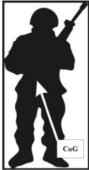
Figure 3. A Stationary Soldier's CoG.