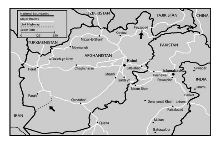
Map 2. Zaranj-Delaram Highway Link from Iran, across Afghanistan, to Tajikistan.

Pakistan. The need to bypass Pakistan, which had consistently stonewalled Indian requests for overland commercial access to Afghanistan and Central Asia, partially drove New Delhi's plan.<sup>35</sup> This plan naturally creates anxiety in Islamabad, which cannot at this point be certain of the success of its own Gwadar scheme (see Map 1).