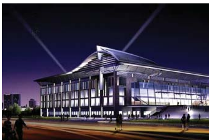
Artist's rendering of the gymnasium at Peking University, the table tennis venue for the 2008 Beijing Olympics.

China may thus be the first case of a lower income country using major tertiary (rather than primary or secondary) transformation in educational delivery as a development strategy and on a scale reflective of China's growth rate and population size. This educational transformation started in the late 1990s and may still only be in its relatively early stages. Potential major impacts follow for China, the global economy, and for the global educational structure. These all reflect the increasing global importance of China's educational system and the competitive impacts on global educational delivery. The implications are relatively little discussed in available literature, but will increasingly form a central element in China's integration into the international economy. There is, in our view, a need for further research in the area.