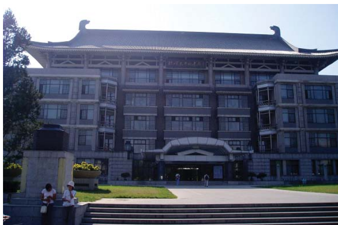
The library at Peking University, one of the largest universities in China