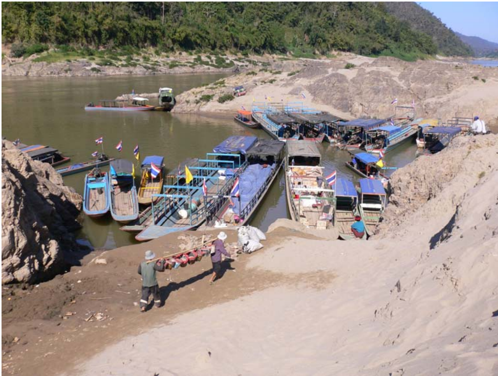
Photograph 2: Chinese vessels at Chiang Saen