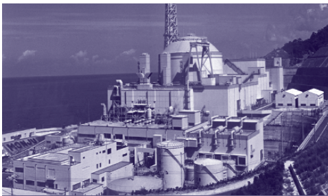
The US$21 billion Rokkasho Reprocessing Plant, Japan

It would be relatively easy for a state with a commercial reprocessing plant to divert a significant amount of plutonium whilst the plant is under IAEA safeguards. The spread of reprocessing facilities therefore inevitably increases the opportunity for and risk of the diversion of plutonium for nuclear weapons programmes.