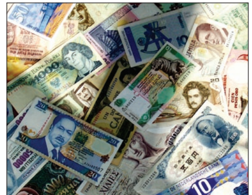
How much does it cost to deliver economic and social rights?

Economic, social and cultural rights were recognised formally in international law in 1966, when they were enshrined in the International Covenant on Economic, Social and Cultural Rights (ICESCR). The ICESCR is the first part of an International Bill of Human Rights, the second being the Covenant on Civil and Political Rights. Both are international treaties and are binding on States Parties under international law. The Vienna Declaration (1993) recognised civil and political rights and ES rights as ‘indivisible, interdependent and interrelated’. The reasoning is that both sets of rights are necessary to establish the integrity and dignity of the person. There is, therefore, no necessary hier-