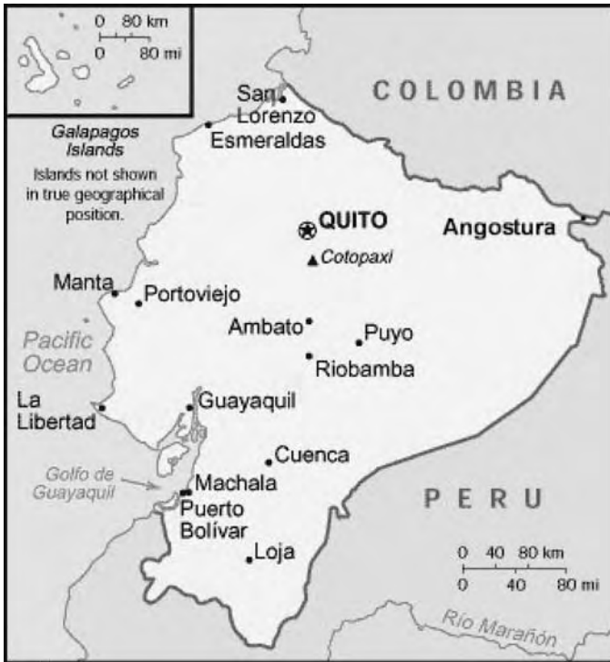
Map 1. Ecuador.

a camp of the terrorist-narco-trafficking Revolutionary Armed Forces of Colombia (FARC) 1.8 kilometers inside the border in a difficult jungle area of Ecuador known as Angostura. 2 The target of the attack was long time FARC leader Raúl Reyes ( nom de guerre for Luis Edgar Devia Silva), who was killed along with 24 others (including four Mexicans and an Ecuadorean). 3 (See Map 1.)