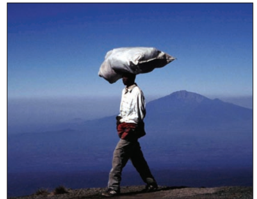
A porter on Kilimanjaro, Tanzania, where local people reap the benefits of mainstream tourism.

The 'pro-poor value chain' approach to tourism has been developed by ODI, the International Finance Corporation (IFC), and the Netherlands Development Organisation (SNV), as a way to shift thinking from projects to interventions that harness markets and deliver impact at scale. By 'value chain' we mean the full range of activities that are required to bring a tourist to a destination and provide all the necessary services (accommodation, catering, retail, excursions, etc.). The approach 'follows the dollar',